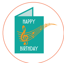
musical card & other novelty items